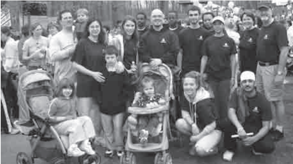
Twenty-one students and family members made up Team Onondaga at the March of Dimes Walk for Babies at Onondaga Lake Park on Sunday, April 6. Onondaga volunteers raised more than $800 to support the March of Dimes in their efforts to ensure that all babies are born healthy.

National Volunteer Week (April 20-26) was a great success at Onondaga Community College. Students, faculty and staff participated in a full range of service projects on the campus and in the Syracuse community including: