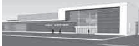
Artists rendering of proposed SRC Arena.