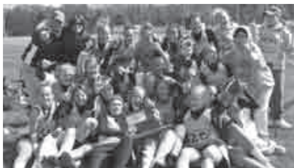
The Onondaga women's lacrosse team captured the NJCAA National Championship title this year in their inaugural season.

For complete highlights on all of Onondaga's championship teams, see page 8.