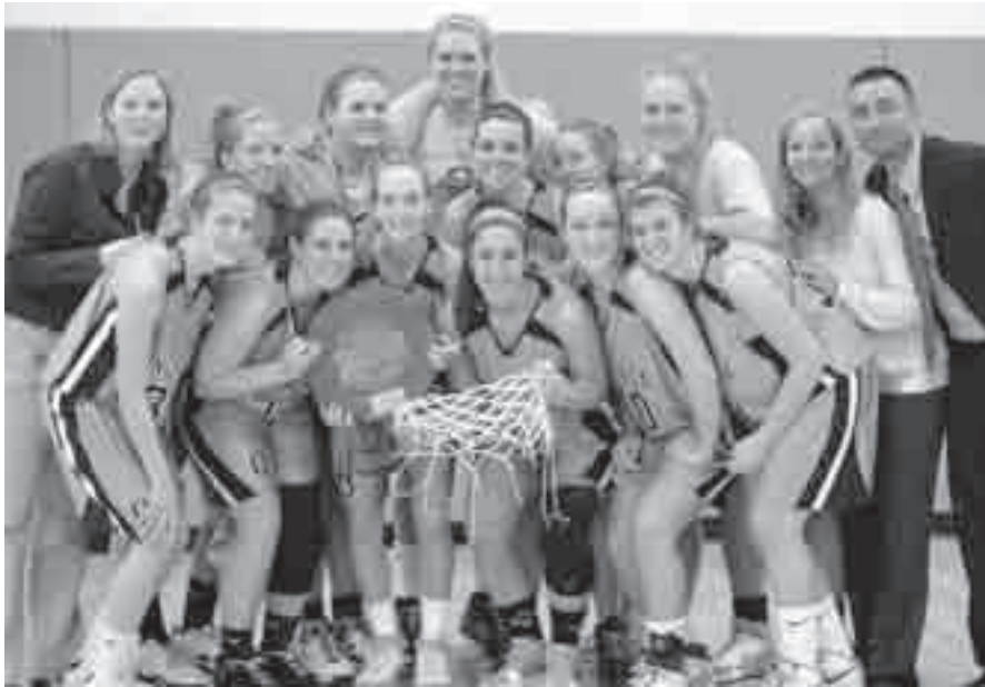
2008-09 NJCAA Region III Division III Women's Basketball Champions.