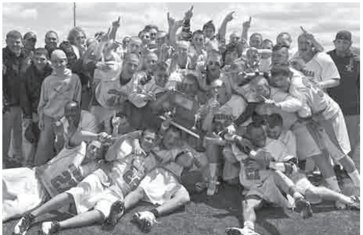
2009 NJCAA Men's Lacrosse National Champions.