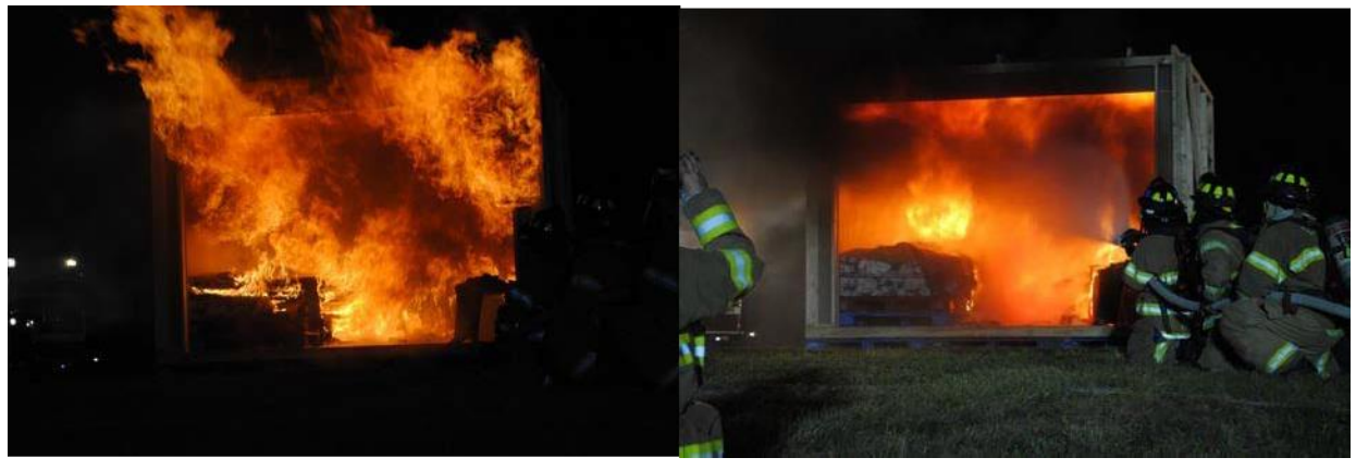
Residence Hall Fire Simulation