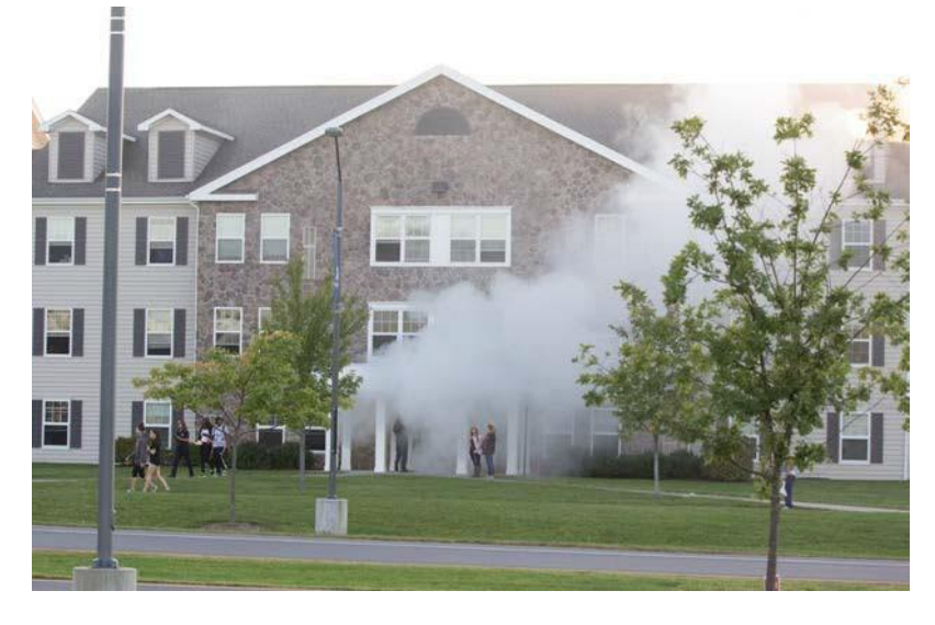
Students participating in the fire safety workshop

Included in the workshop is a residence hall fire simulation. The Residence Hall fire simulation will demonstrate the importance of Resident Hall fire safety evacuation training programs and will include the building being under full alarm, loss of power and lights, room and hall smoke generation and blocked egress routes. Multiple emergency response agencies and emergency management teams will participate in this controlled building evacuation exercise.