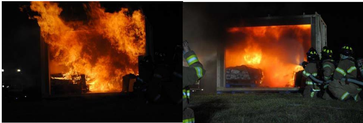
Residence Hall Fire Simulation