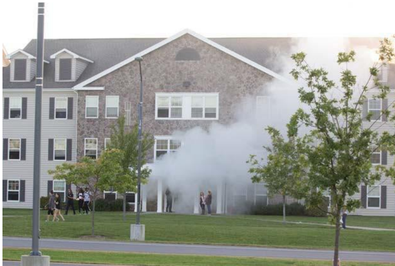
Students participating in the fire safety workshop