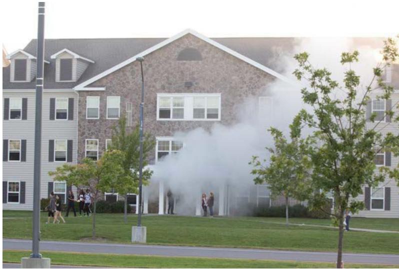
Students participating in the fire safety workshop